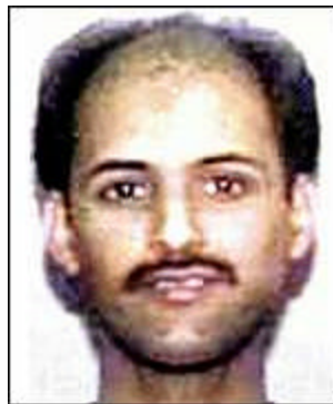
Khalid Al-Midhar may also be alive

And there are suggestions that another suspect, Khalid Al Midhar, may also be alive.